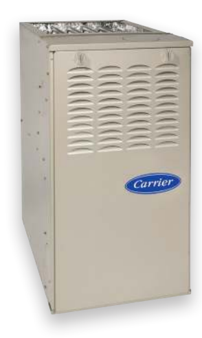
58DLA, 58DLX, 58STA, 58STX