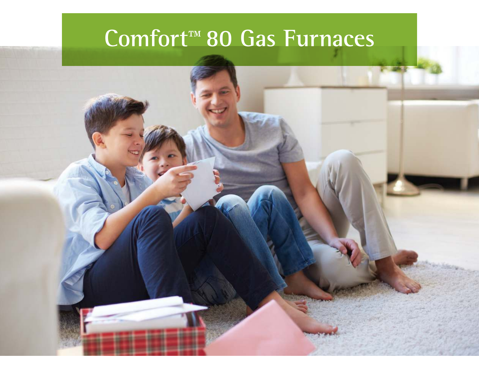
Quiet, reliable comfort with 80.0% AFUE