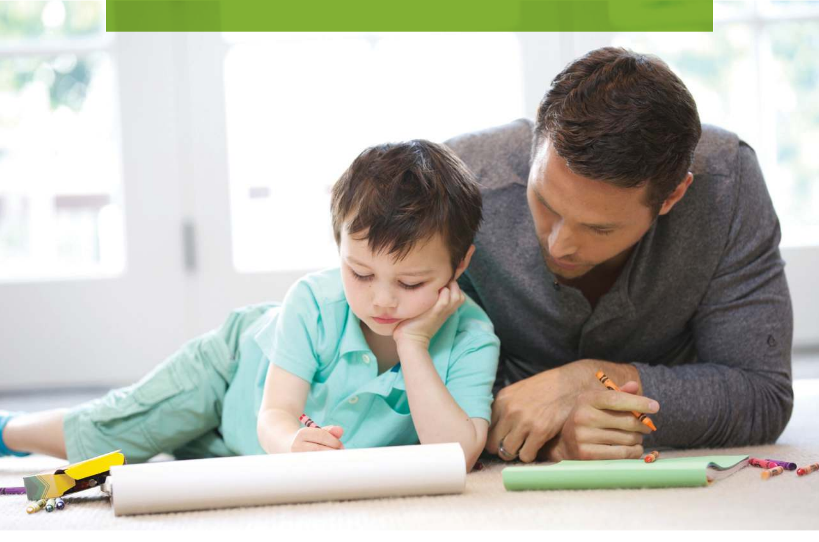
Proven, reliable comfort, up to 16.5 SEER rating