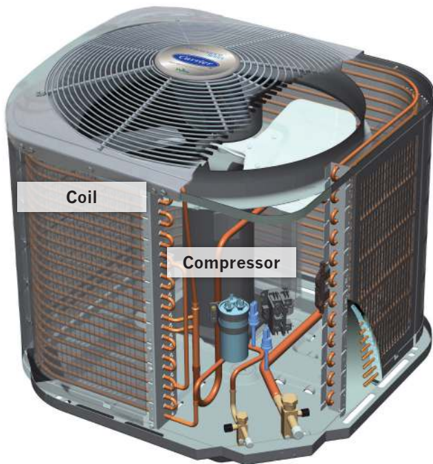
Performance™ 17 Air Conditioner Shown

Wi-Fi® is a registered trademark of the Wi-Fi Alliance Corporation.